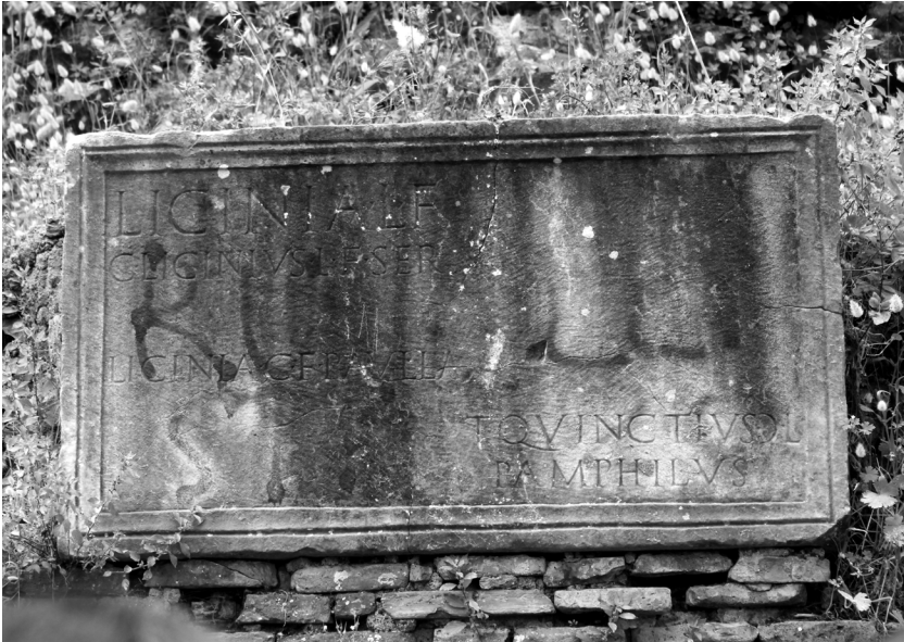
Figure 6: CIL , VI 21312.

In all the above instances, having the inscribed texts and the related images digitised and available through one of the repositories aggregated by EAGLE will ensure somehow their survival. Although this cannot prevent further future destruction of artefacts, at least it does increase our chances that information will not be lost, and therefore yields the possibility of reading and studying these documents, thus keeping—so to speak—an open window on our past.