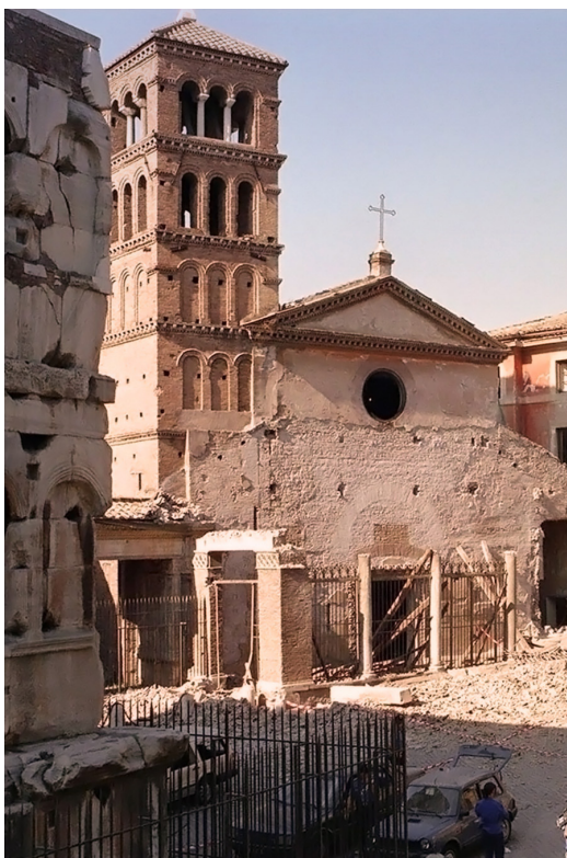
Figure 4: S. Giorgio al Velabro.  17

40718 (= 1123) tit. honorarius imperatoris