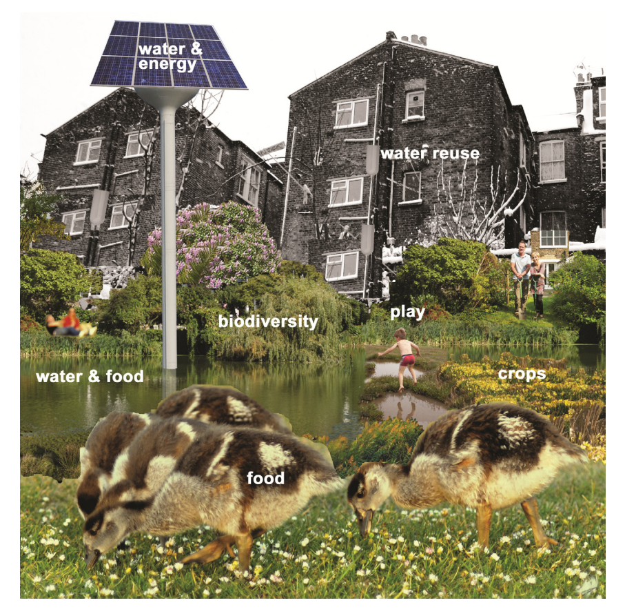
Figure 1: Photomontage of new infrastructure spaces for water reuse, energy production, food production, biodiversity and recreation.