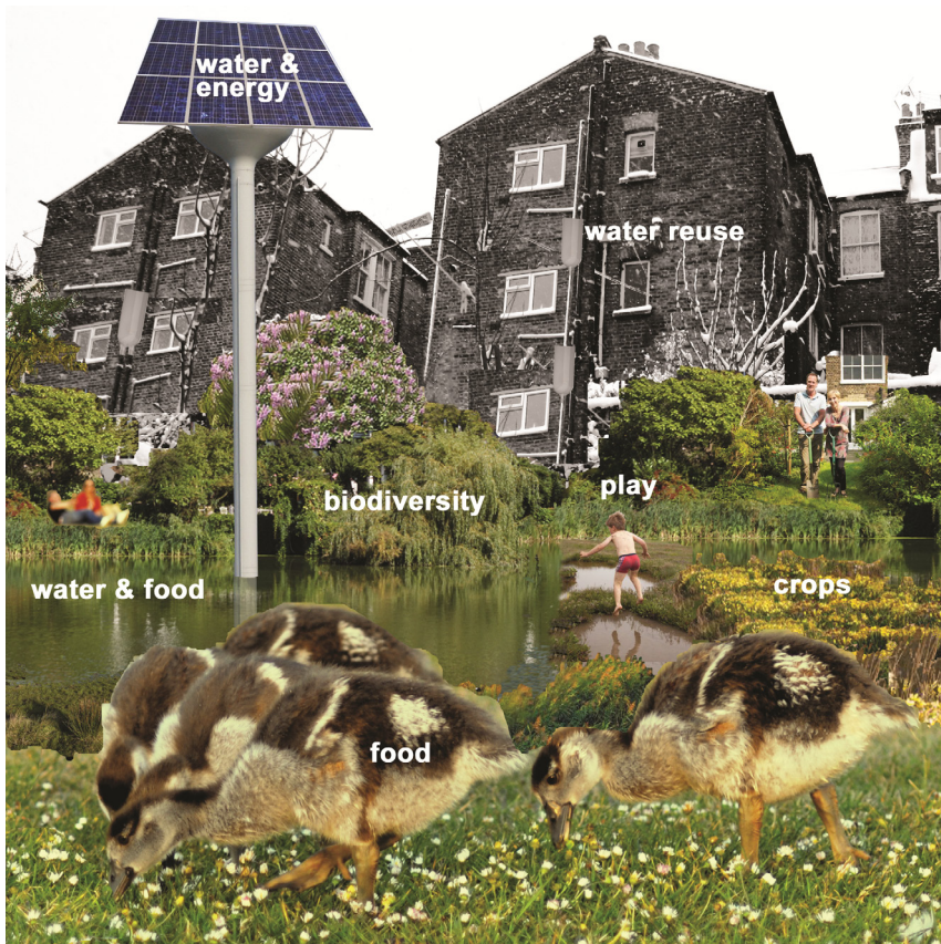
Figure 1: Photomontage of new infrastructure spaces for water reuse, energy production, food production, biodiversity and recreation.

Teh, T. 2013. Hydro-urban London. In: Bell, S and Paskins, J. (eds.) Imagining the Future City: London 2062 . Pp. 95-96. London: Ubiquity Press. DOI: http://dx.doi.org/10.5334/bag.m