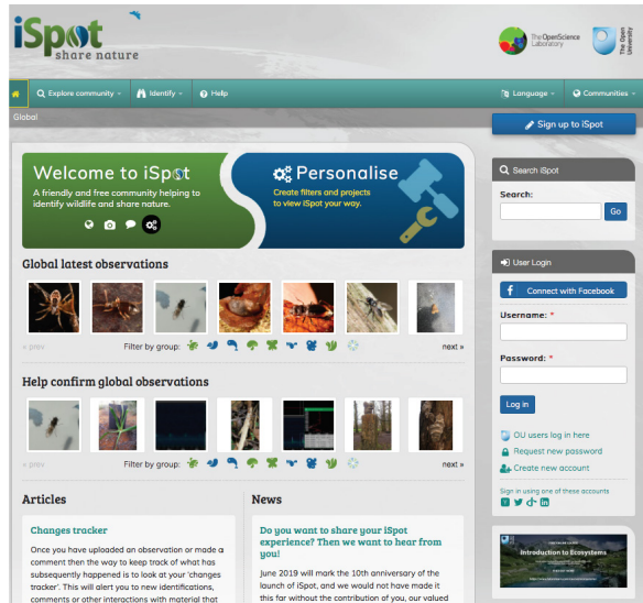
Figure 8.2: The iSpot platform supporting species identification.

iSpot was incorporated into the OU's Open Science Laboratory which allows anyone, anywhere to access practical science education. iSpot also supports Open University / BBC broadcasts, the Open Science Laboratory, and was used in three environmental courses.