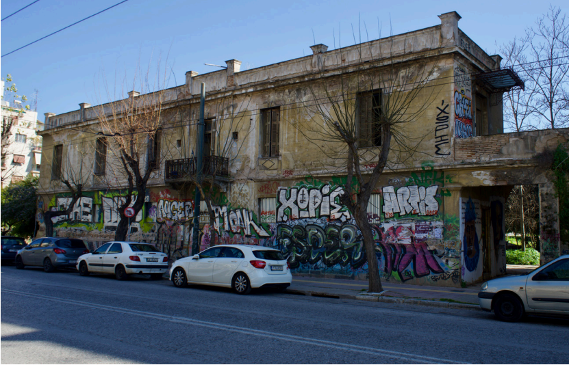
Figure 2: Ktima Drakopoulou. Drakopoulou estate contains a complex of buildings from the 19 th c. bequeathed to the Greek Red Cross in 1977. Delisted in 2003 and partially demolished in 2009, buildings and green space are now in grave danger of complete destruction to make space for new development.