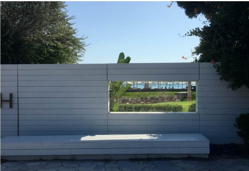
Figure 3: Observing Apollo Zoster's temple outside the fence (Source: author, 2019).