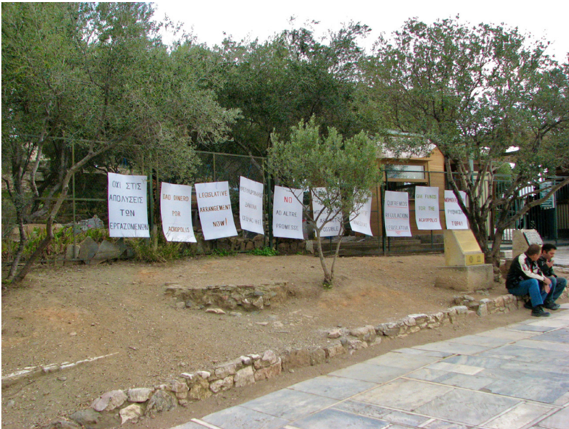
Figure 4: Demonstrating outside the Acropolis of Athens.

The 2012 conference of the professional association of archaeologists working in the Ministry of Culture affirmed that ‘monuments belong to all’ (Sylogos Ellinon Archaiologon 2002). However, in many cases priorities are set by monopoly interests of persons or groups. Thus, even though a detailed description of the structures and power struggles within the Greek Archaeological Service is yet to be composed, a number of templates producing crypto-private heritage resources are familiar to individuals either working or liaising with the Ministry of Culture services, relating to heritage resources, framework