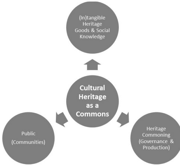
Figure 5: Re-reading heritage as commons: Resources, Communities, Commoning.

out, as commons are dynamic and porous processes, they always involve shared resources which are managed, produced and distributed collectively – in common stewardship – in ways that contest both private and state property logic (Hardt & Negri 2012: 69–80).